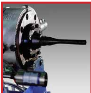
Corrugated tube head