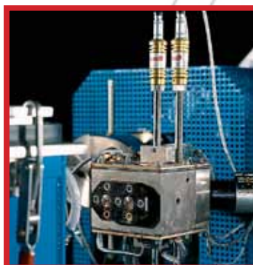
Tandem double injection head